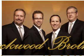
2:00 PM Blackwood Brothers 6:00 PM January 12, 2018

THURSDAY: GATHERING PLACE CONCERT - 10:00 AM